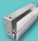
ABK-700 Full Glass Door Leaf and Door Frame